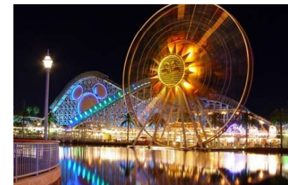
Entertainment & amusement parks