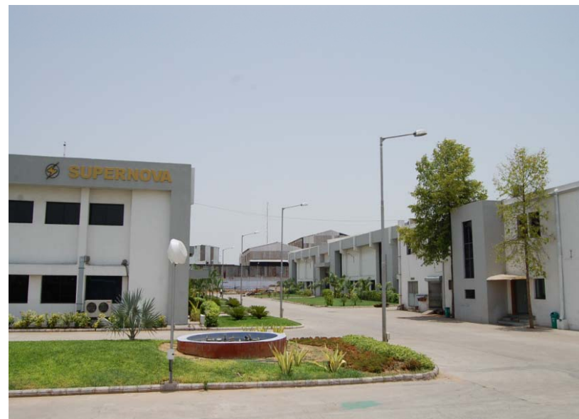
MANUFACTURING PLANT, 2010