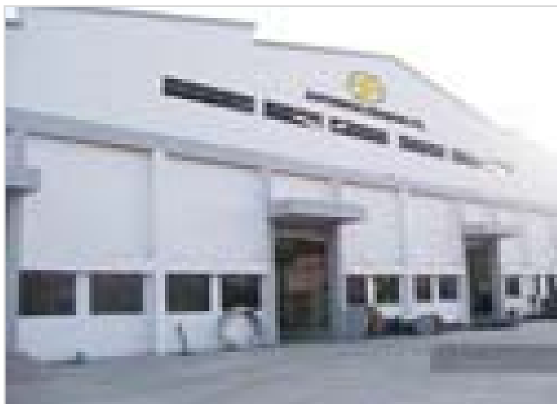
MANUFACTURING PLANT, 1985