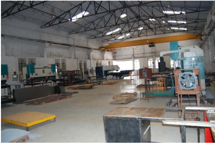
AUTOMATIC SHEERING, CUTTING & BENDING