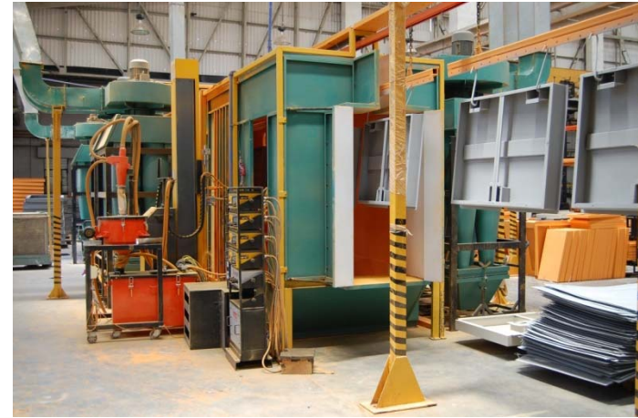
AUTOMATIC POWDER COATING